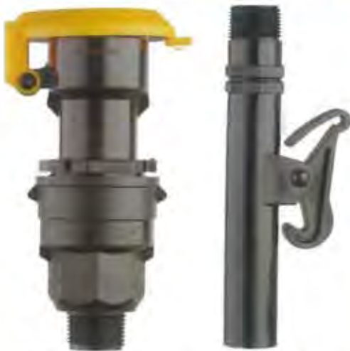
Quick Coupling Valve

The Quick Coupling Valve system consists of: